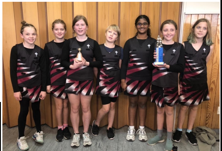
Absent in the photo: Charlotte Holmes