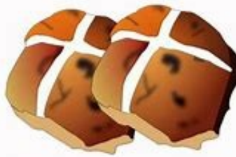
Hot Cross Buns!